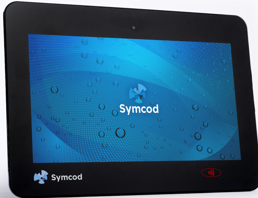
W185M-69K, 18.5" touch screen with integrated camera and proximity reader

Known to comply to the highest quality standards and industry standards; the W185M-69K is the industry's most waterproof computer you need!