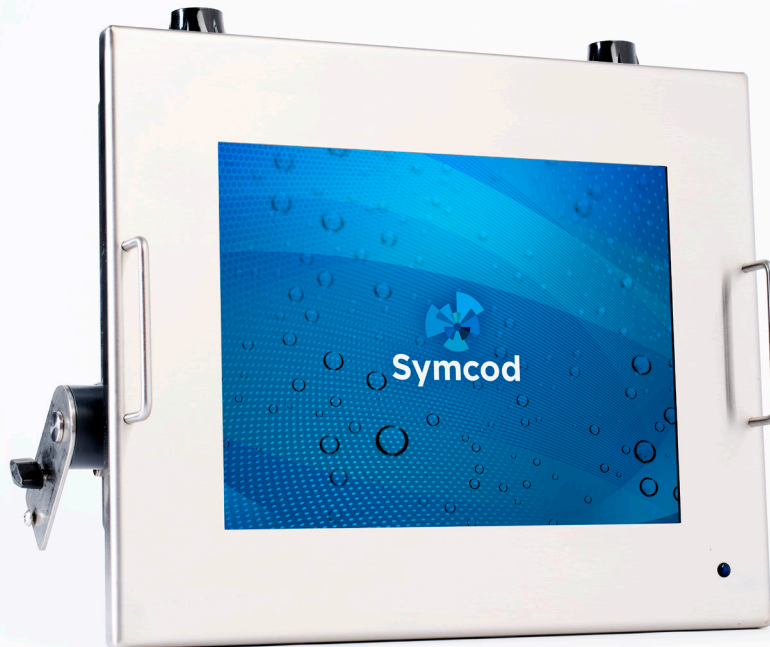
XR15-66, 15" touch screen

Known for its robustness and versatility; the XR15-66 is the computer you need!