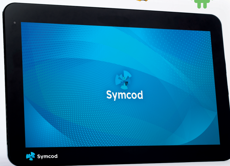
W156M, 15.6" touch screen